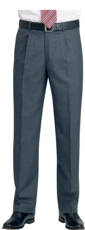
BRANMARKET Trousers (Mid Grey) Single pleat trouser, easycare, 1 hip pocket, French bearer.

Machine washable 55% Polyester, 45% Wool 420 grams per linear metre