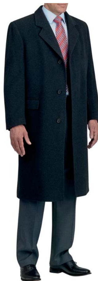
CROYDON Overcoat (Black) Single breasted, fly front, centre vent, satin lined, hand stitched edges.

60% Polyester, 20% Cashmere, 20% Polyamide