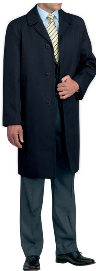
WHIPCORD Raincoat (Black) Single breasted, 3 button fly front, centre vent, raglan sleeve, viscose check lining.

Coordinates with Mix & Match Jacket on page 135